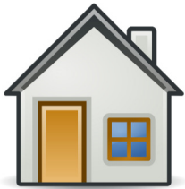
stay at home

Coronavirus can make people have a sore throat, feel hot and have a cough. Most people need to stay at home, rest and drink plenty of water.